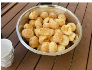
Photos: Group photo of Year 11 students and pão de queijo for lunch