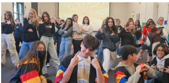
Photo: Year 11 Beginner students performing 'Head, Shoulders Knees and Toes'