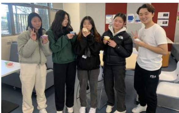
Photo: Year 12 Korean in Context students with their rice-cake

Year 11 Korean Beginners will compete as the final contestants of the 2023 Korean Performance Contest with their energetic and well-choreographed performance of 'Head, Shoulders, Knees and Toes' in reference to the body parts learned this term.