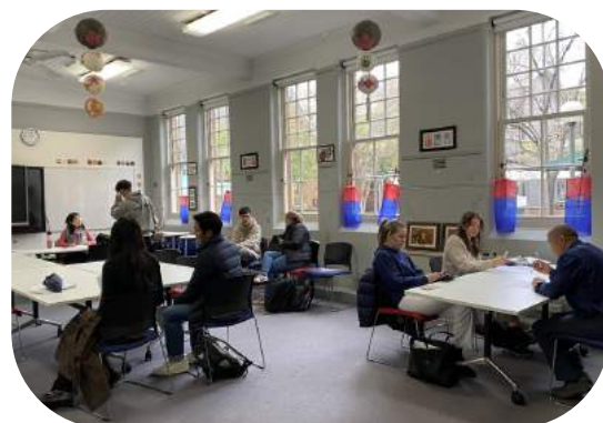
Photo: Year 12 students doing mock speaking exam

In addition, the teachers created an inspiring and motivating environment for the development of speaking skills by conducting two mock speaking examinations. This integrated approach not only improves students' language proficiency, but also boosts their enthusiasm in their learning journey.