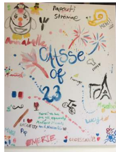
Photo: French Beginners class of 2023 farewell painting