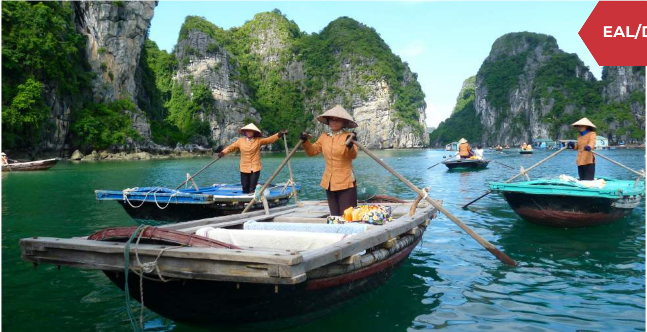
Photo: Halong Bay, Vietnam