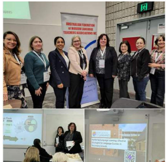
Photo: NSL staff attended the National Language Teacher Conference in Perth.

During the July school holidays, a team of teachers traveled to Perth to participate in the AFMLTA conference. The Senior Executive presented a session titled 'Nurturing Language Learning: Effective Strategies for Language Courses in Secondary Schools.' In this session, we showcased our new Canvas courses and innovative online teaching pedagogy. We received a lot of positive feedback and gained insights into the teaching of languages in other states of Australia and New Zealand.