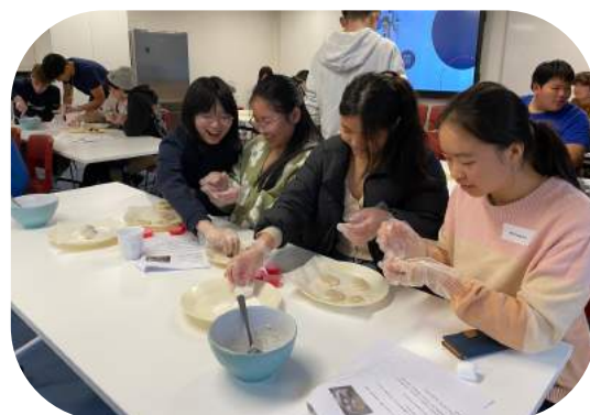
Photo: Year 11 students making Chinese sweets

Along with practising all four language skills, students engaged in cultural immersion activities like drinking Chinese tea and making Chinese sweets (glutinous rice balls). This approach encourages students to take an active role in their language learning process in addition to making the learning process more interesting and enjoyable.