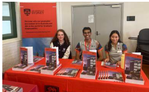
Photo: One of the universities display table