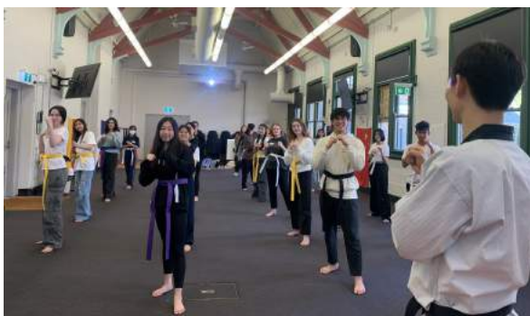
Photo: Year 9 and 10 Korean students attending Taekwondo lessons with the master

Year 12 Korean in Context students made traditional Korean rice cake '찰떡' (chapssal ddeok). In Korea, it is believed that eating this 'sticky' sweet can help 'stick' the materials studied by the student to their mind, hence a popular gift for students sitting for exams!